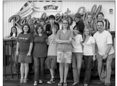
EYG members hit the putt-putt circuit

Thank you to all of the parishioners who provided meals for the EYG as well as the goodies for our lock-in.